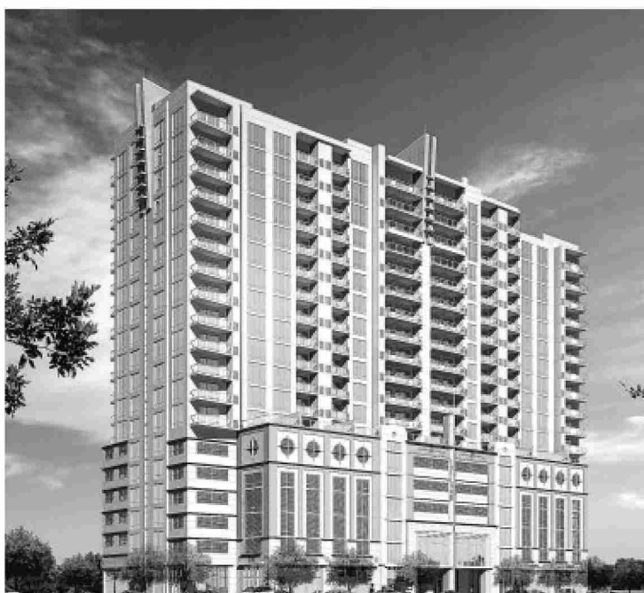
LANE FLORIDA LLC